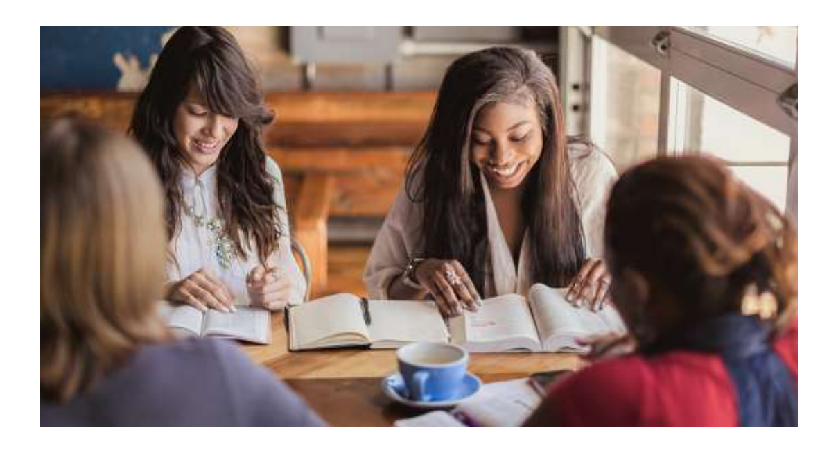
*(see over for questions/discussion)